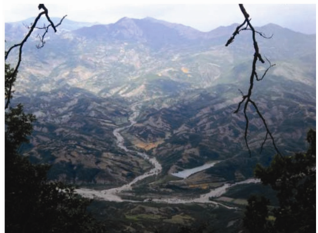
Figure 5. Life-value.