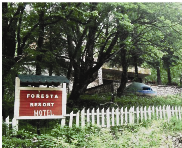
Figure 3. The forgotten bunkerization.

Striking, however, is the lack of visitors in a place that has all the prerequisites for mass tourism. Directly at the foot of the mountain lies a dilapidated hotel, whose once-fine fence protects a large garden – rampant, neglected and overgrown. The big open-air café is empty. The word 'Hotel' has been added to the building's run-down 'Forest Resort' sign. The garden hides several of the grey cement bunkers that the dictator Enver Hoxha forced the country to build in the 1950s during the communist era. These bunkers are found everywhere and cover the entire country. It is estimated that there are around 700,000 of them – in the words of Howden 23 an image of 'paranoia dressed in cement and iron'. For some people, the bunkers are materialized memories of old oppression, while for others they represent a glorious past (Figure 3). But the bunkers in the wild and overgrown garden are isolated,